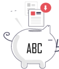
Transfer of Credits